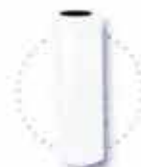
Pallet wrap & stretch film