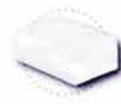
Wood pellet bags