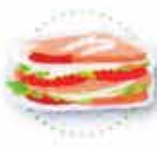
Ziploc & other reclosable food storage bags