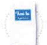
Dry cleaning bags