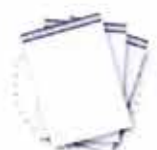
Plastic shipping envelopes